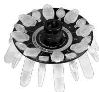
R-2/0.5 BS-010205-CK rotor

Rotor for 8 x 2/1.5 ml and 8 x 0.5 ml microtest tubes