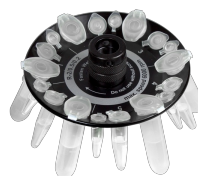
R-2/0.5/0.2 BS-010205-DK rotor

Rotor for 8 x 2/1.5 ml and 8 x 0.5 ml microtest tubes