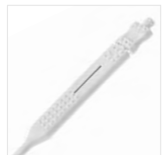
Ergonomical handle with defined breaking point