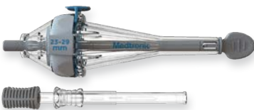
Evolut PRO+ Loading System