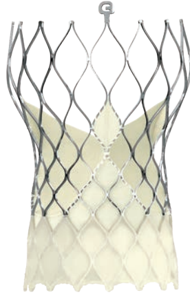
Evolut PRO+ 26 mm Valve