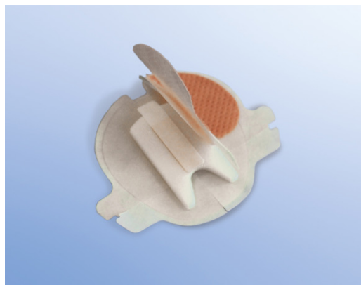
Epidural Catheter Dressing