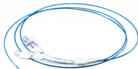
3-lumen stone extraction balloon from MICRO-TECH