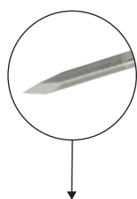
• 672.250 | Guide Wire 2.5mm x 225mm With Threaded Tip