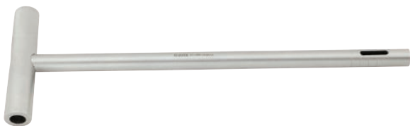
• 651.008 | DHS/DCS Wrench