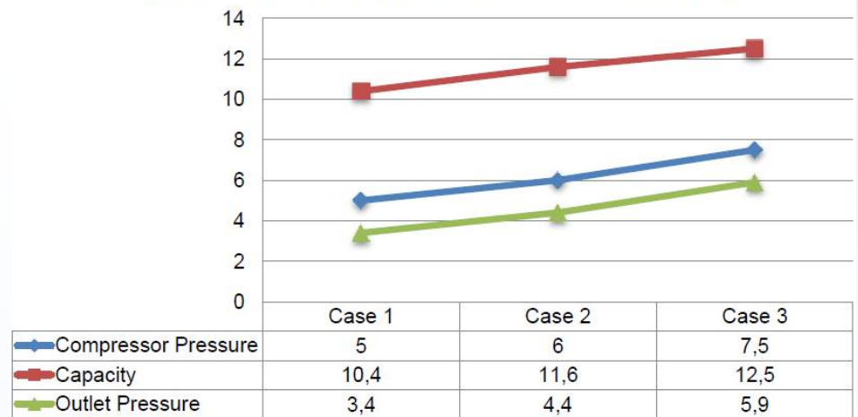
Oxygen Generator Compressor Pressure - Output Capacity - Output Pressure Graph

Feed Air Pressure: 7,5 bar(g) Ambient Temperature: 20 °C Purity: 95 % Capacity: 12,5 Nm 3 /h Outlet Pressure: 5,9 bar(g)