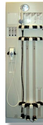
TEE Cleaning System