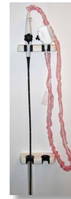
TEE Storage Rack