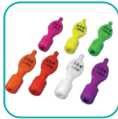
Colored pilot balloon with size printed