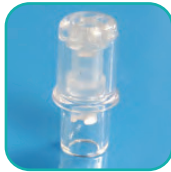
Silicone check valve for MRI compatible type