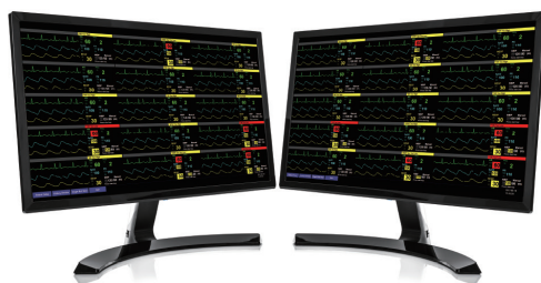
Dual Screen Central monitoring station

Central station / Ultra slim design / Over 5 hours battery use