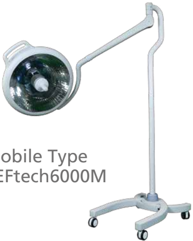
Mobile Type REFtech6000M