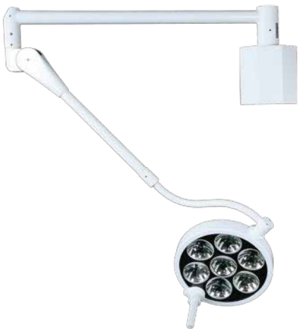
Wall Type LEDtech3000W