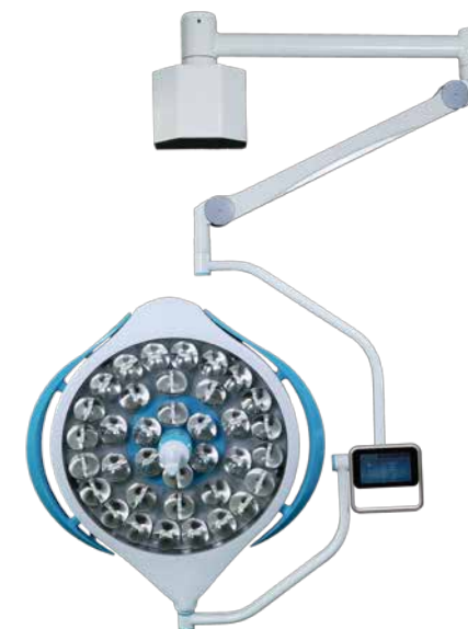
Wall Type Delux7500W