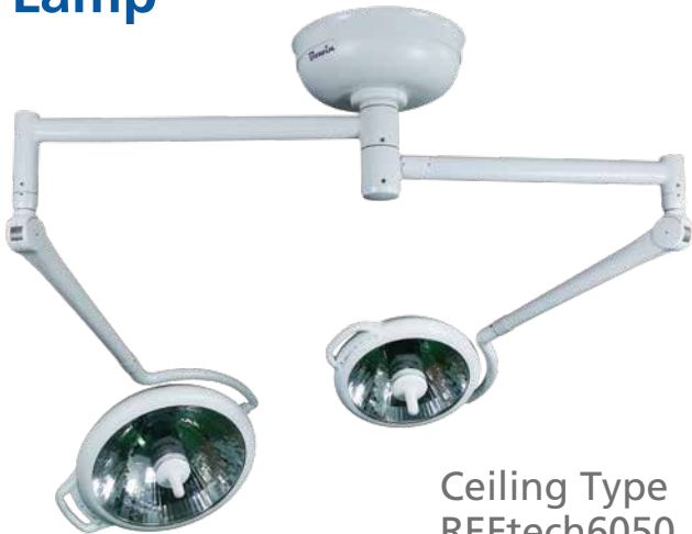
Ceiling Type REFtech6050