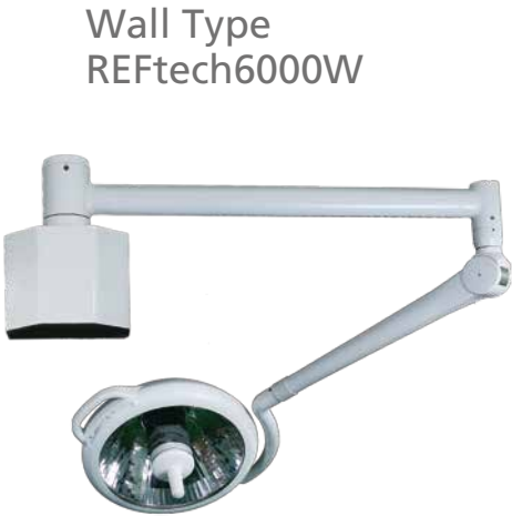
Wall Type REFtech6000W