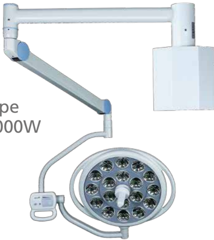
Mobile Type LEDtech7000W