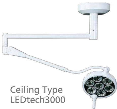
Ceiling Type LEDtech3000