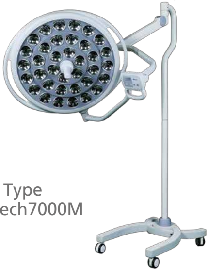
Wall Type LEDtech7000M