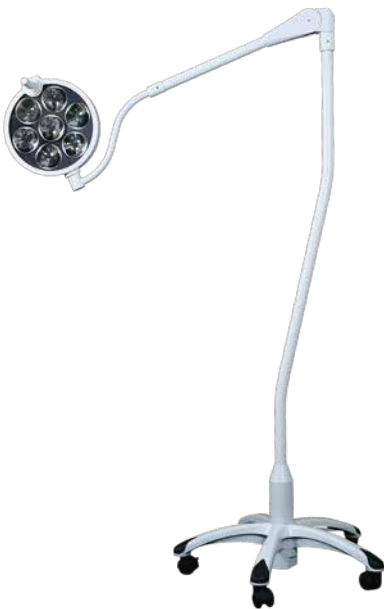
Mobile Type LEDtech3000M