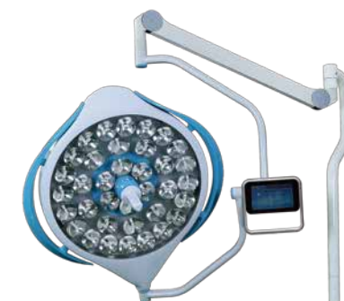
Mobile Type Delux7500M