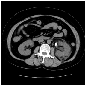
Fig. 6 CT Image

In light of the above findings, ureteral calculus was diagnosed and ESWL scheduled. However, one week after the initial diagnosis, the patient presented with a fever of 39.4 °C in the night, and therefore received emergency consultation. The patient was diagnosed with pyelonephritis associated with calculus (Fig. 6). After admitting the patient, antibacterials were admitted to alleviate fever and provide pain relief, but by the following day fever remained and the patient's inflammatory response (CRP, etc.) was more intense, so a stent placement was determined necessary and immediately implemented. The stent was placed without particular incident (Fig. 7). From the following day her fever was alleviated, further 2 days later antibacterials were administered, and patient discharge occurred 6 days after admission.