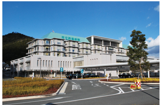
Fig. 1 View of Nishiwaki Municipal Hospital

The current hospital is an entirely new building of which construction started in March 2004 and its grand opening occurred in November 2009 ( Fig. 1 ). In the new hospital, the patient records are digitized, and with each year the hospital has come to play an increasingly large role as a key hospital for the coordination of regional cancer treatment and as a support hospital for regional medicine. This has resulted in the services Nishiwaki Municipal Hospital provides becoming indispensable to northern Kita-Harima.