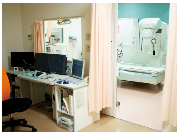
Fig. 3 Radiography Room at the Department of Urology

It goes without saying that in the field of urological medicine, every outpatient examination and procedure is important. The hospital block that contains the Department of Urology has 2 consultation rooms, an X-ray room that is independent from the central radiology block, an extracorporeal shock wave lithotripsy (ESWL) room, and a cystoscopic procedure room. The X-ray room in particular is used for a variety of procedures, including procedures that involve various types of endoscopic catheter placement and replacement such as the intravenous pyelogram (IVP), cystographic examination, and nephrostomy extension. The urological radiography system made by Toshiba that was in use for around 20 years since 1990 exceeded its serviceable life, and in 2012 a medical system purchasing (renewal) application was submitted to the hospital medical system and maintenance committee. As a result, in November 2013 a system selection committee meeting was held and after presentations from Shimadzu, Hitachi, and Toshiba, Shimadzu's SONIALVISION G4 (hereafter "G4") was eventually selected (Fig. 3).