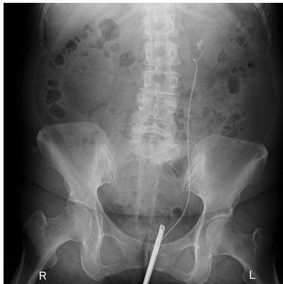
Fig. 7 KUB Image

The previous method of stent placement and replacement in cases such as this involved manipulating the catheter while alternating between viewing fluoroscopic images and endoscopic images. With the G4, these images can now be viewed simultaneously on the same screen, which allows