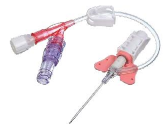
Nouovo Safety Set