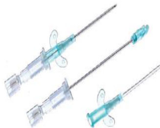
Polywin Plus Safety