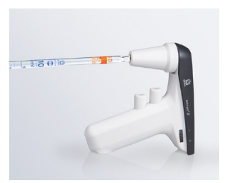
Rest position with inserted pipette