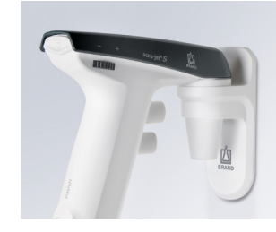
Wall mount for space-saving storage