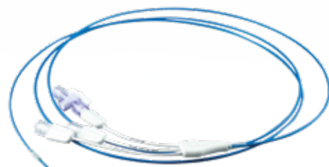
3-lumen stone extraction balloon from MICRO-TECH