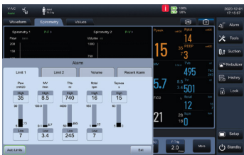
Automatic alarm limit

Benefit from the intuitive UI design of V3, it only takes two steps to adjust ventilation parameters. The functional layout is clinically applicable, and what you think is what you get.