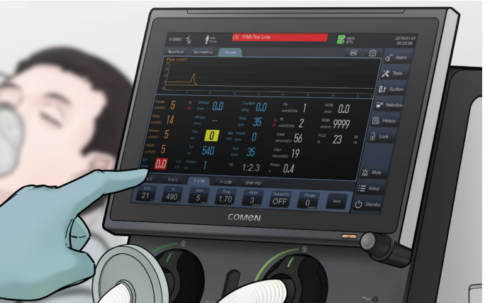
Monitoring — assessment of respiratory status