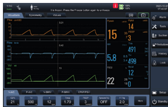
Waveform measurement tool