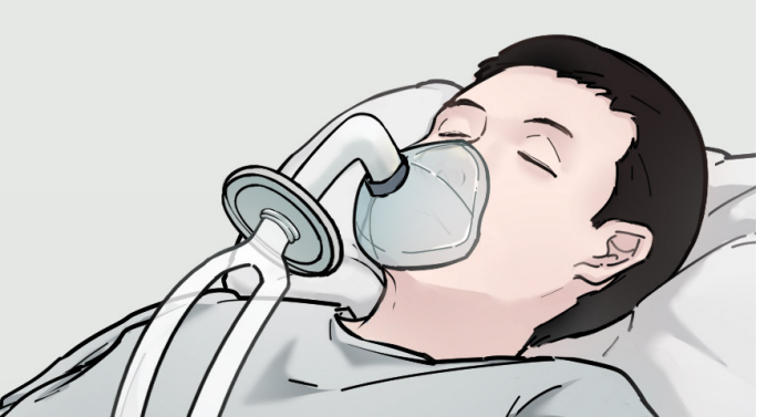
Non-invasive therapy — NIV and O 2 therapy

With extensive ventilation modes and smart sync techs, V3 offers a whole range of treatment: O 2 therapy-monitoring-weaning