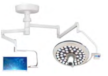
E700 Internal Camera