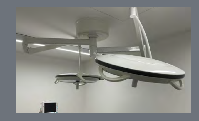
Astro Space Design, Working seamlessly with laminar airflow solutions