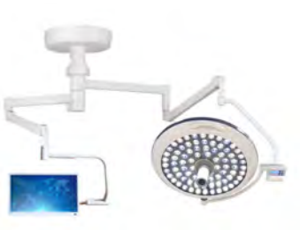
E500 Internal Camera