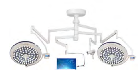
E700/700 External Camera