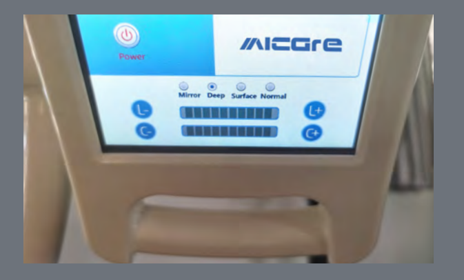
5.1INCHES LCD Touch Panel Optional (OEM With LOGO Print Available)