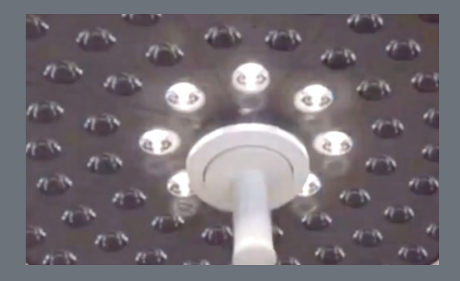
Endoscopy Mode In Deep Illumination For Various Operation Environmental

Maximum illumination up to 180,000 lux Stable and constant illumination Enhanced visibility, diagnosis and treatment