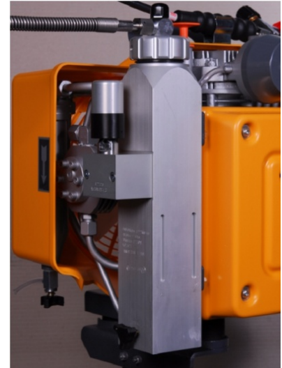
Purification System P11/350