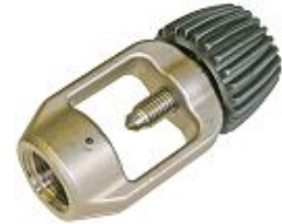
International cylinder connection