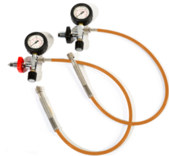
Filling hose PN200 (black) PN300 (red)