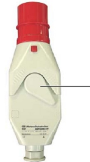
Motor protection switch