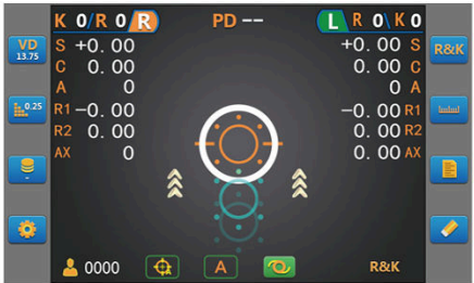
Auto tracking ( Y axis )

Adopt the ARM Cortex-A8 processor, which makes the measurement more faster and accurate. The touch screen provides friendly user interface, and makes the operation more convenient.