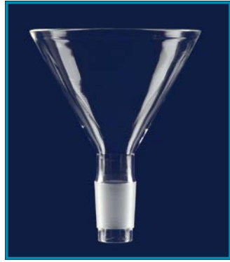
FUNNELS - "powder" - "P.P & glass"