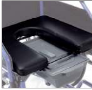
Cod. CPA110-45 WC seat 45 cm (size 45 only)