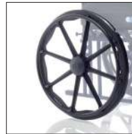
Cod. CPR122 Solid rear wheel Ø 60 cm – PAIR (only for CP300)