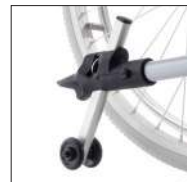
Cod. CAR314 Anti-tipper wheel - PAIR