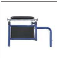
Cod. CPA154 Armrest adjustable height 69÷79cm from floor - PAIR (only for CP300, CP310)