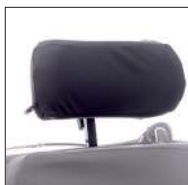
Cod. CAR705 Anatomic PU headrest