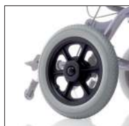
Cod. CAR219 PU rear wheel - PAIR (CP900)