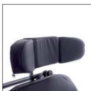
Cod. CAR710 3 section headrest