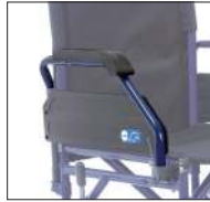
Cod. CPR101 Complete armrest PAIR (only for CP500)