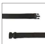
Cod. RP247 Safety belt with spring buckle