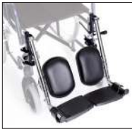
Cod. CAR171 Elevating footrest - PAIR (for CP800-CP805 only)