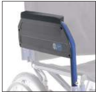
Cod. CPR610 Complete armrest PAIR (only for CP620- CP625)