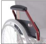
Cod. CPR400 Complete armrest PAIR (only for CP100R)