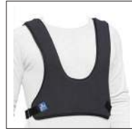
KOALA Restraining system line