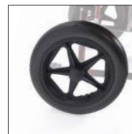
Cod. CPR412 PU solid rear wheel Ø 30cm – PAIR (only for CP500R)