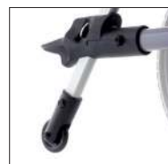
Cod. CAR316 Anti-tipper wheel - PAIR