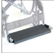
Cod. CPA130 Footrest (for sizes 46 only)