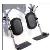
Cod. CPA120C Cod. CPA122C (only for 38 size) Chrome-plated elevating footrests -PAIR