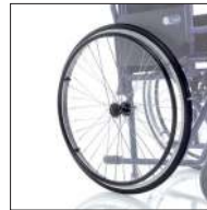
Cod. CPA242 U rear wheel Ø 60 cm – PAIR (only for CP110- CP200-CP205)