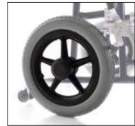
Cod. CAR175 PU rear wheel - PAIR (only for CP805)