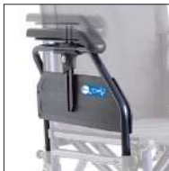
Cod. CPR108 Armrest adjustable height 73÷81 cm from floor - PAIR (only for CP520)