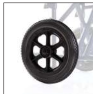
Cod. CPA240 PU rear wheel - PAIR (only for CP110, CP200)