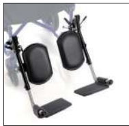
Cod. CPA120V Cod. CPA122V (only for 38 size) Painted elevating footrests -PAIR