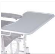
Cod. CPA506 Table for wheelchair 58x38 cm