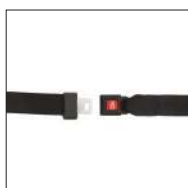
Cod. RP245 Safety wheel