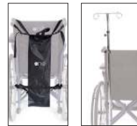
Cod. CPA606 Cod. CPA600 Polyester Adjustable IV pole Oxygen bottle holder Ø bottle max 12 cm