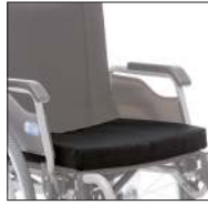
Cod. CPA100-40 , CPA100-43 , CPA100-45 , CPA100-50 Foam cushion 5 cm h