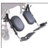
Cod. CPA121 Painted elevating footrests -PAIR