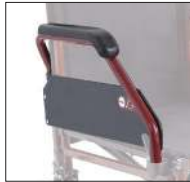
Cod. CPR401 Complete armrest PAIR (only for CP103R- CP500R)