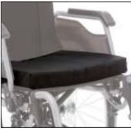
Cod. CPA100-40, CPA100-43, CPA100-45 Foam cushion h 5 cm