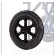
Cod. CPA240 PU rear wheels – PAIR (only for CP115- CP205)