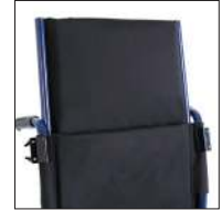
Cod. CPA140-xx Universal backrest extension - specify the size 38/40/43/45/48/50/55/60 (No red models)