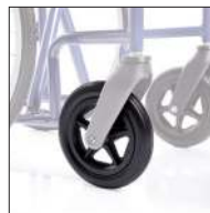
Cod. CPR620 PU front wheel Ø 18cm – SINGLE (only for CP620- CP625)