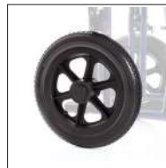
Cod. CPR622 PU solid rear wheel Ø 30 cm - PAIR (only for CP620)