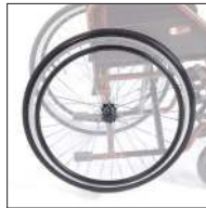
Cod. CPR413 PU rear wheels Ø 60cm – PAIR (only for CP100R- CP103R)