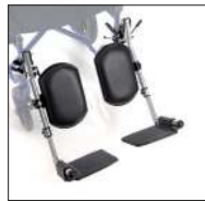
Cod. CPA120C Cod. CPA122C (only for 38 size) Chrome-plated elevating footrests -PAIR