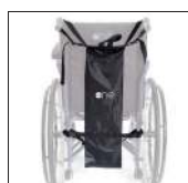
Cod. CPA606 Polyester Oxygen bottle holder - Ø oxygen bottle Max 12 cm