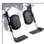
Cod. CPA120V Painted elevating footrests - PAIR