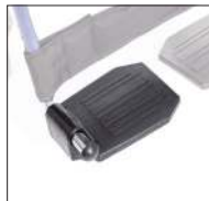
Cod. CPR241 Plastic footrest SINGLE (only blue models)