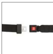
Cod. RP245 Safety belt