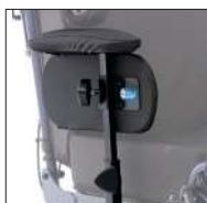
Cod. CAR832 Elevating armrests - PAIR