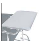
Cod. CPA501 Linear table for wheelchair 55x32 cm (except size 50)