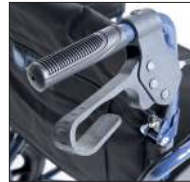
Cod. CPR215S Left Cod. CPR215D Right Brake (only for CP520)