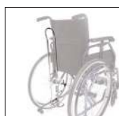
Cod. CPA605 Chromed steel oxygen bottle holder Ø Max oxygen bottle 12 cm