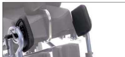
Cod. CAR719 Knee adductor protection - PAIR