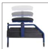
Cod. CPA154 Armrest adjustable height 69÷79cm from floor - PAIR