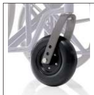
Cod. CPR141 PU front wheel Ø 20x5 cm - SINGLE (only for CP300- CP305)