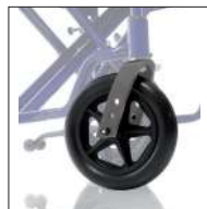
Cod. CPR143 PU front wheel Ø 20x3 cm - SINGLE (only for CP200- CP205-CP500- CP520)