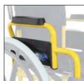
Cod. CPR810 Flip up armrest -PAIR