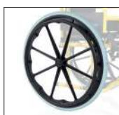
Cod. CPR821 PU rear wheel Ø 56 cm - SINGLE