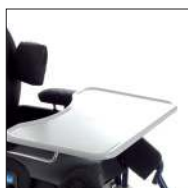
Cod. CAR525 Wheelchair table