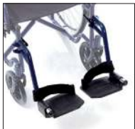
Cod. CPR111 Swing away lateral footrests – PAIR