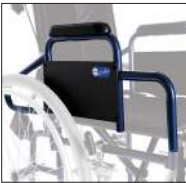
Cod. CAR831 Desk type armrest - PAIR (for CP800-CP805)