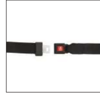
Cod. RP245 Safety belt (CP810 only)