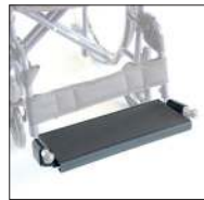
Cod. CPA130 Footrest (sizes 45, 46, 48, 50, 55 only - No red models)