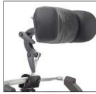
Cod. CAR900 Headrest