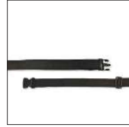
Cod. RP247 Safety belt with spring buckle