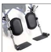
Cod. CPA120C Chrome-plated elevating footrests - PAIR