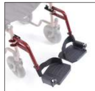
Cod. CPR415 Swing away lateral footrests – PAIR (series CP100R-CP103R-CP500R)