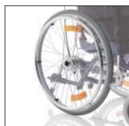
Cod. CAR218 PU rear wheel - PAIR (CP910)