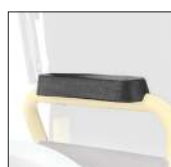
Cod. CPR827 Armrest padding only