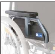
Cod. CAR830 Elevating armrest - PAIR