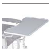
Cod. CPA506 Table for wheelchair 58x38 cm (except size 50)