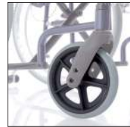
Cod. CAR172 PU front wheel Ø 20 cm - PAIR (only for CP800)