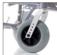
Cod. CAR226 PU front wheel - PAIR