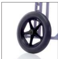
Cod. CPR132 PU rear wheel Ø 32 cm - PAIR (only for CP310)