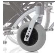
Cod. CAR226 PU front wheel - PAIR