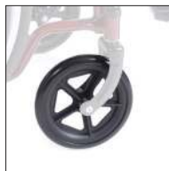
Cod. CPR410 PVC front wheel Ø 20 x 2,5 cm - SINGLE (only for CP100R)