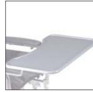
Cod. CPA506 Table for wheelchair 58x38 cm (except sizes 50-55-60)