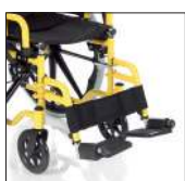
Cod. CPR815 Lateral footrests