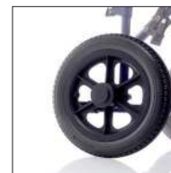
Cod. CPR131 PU rear wheel Ø 30 cm - PAIR (only for CP500-CP520)