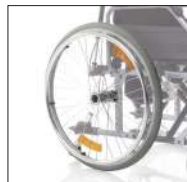
Cod. CAR217 PU rear wheel - PAIR