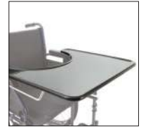
Cod. CPA517 Table for wheelchair 68x57 cm (sizes 50-55-60 only)