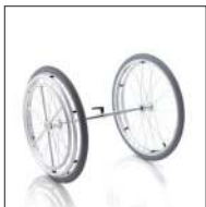
Cod. CPA234 One hand drive kit