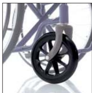
Cod. CPR140 PVC front wheel Ø 20 x 2,5 cm - SINGLE (only for CP100- CP102-CP110-CP115)