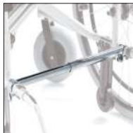
Cod. CAR605 Anti-heft bar (except CP620, CP625)