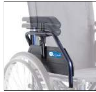
Cod. CPR108 Height adjustable armrest PAIR (only for CP200, CP205)