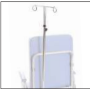
Cod. RCA120 IV pole (image for illustrative purpose only)