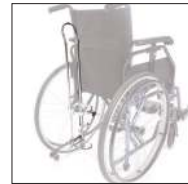
Cod. CPA605 Oxygen bottle holder in chromed steel Ø bottle max 12 cm