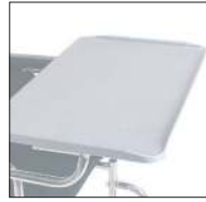
Cod. CPA501 Linear table 55x32 cm (except sizes 50-55-60)