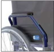
Cod. CPR100 Complete armrest PAIR (only for CP100, CP102)