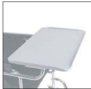
Cod. CPA501 Linear table 55x32 cm