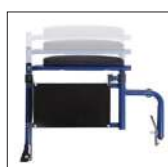
Cod. CPA150 Armrest adjustable height 74÷82cm from floor - PAIR