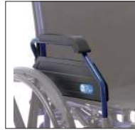
Cod. CPR103 Complete armrest PAIR (only for CP300- CP310)