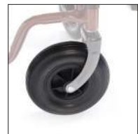
Cod. CPR411 PU front wheel Ø 20 x 5 cm - SINGLE (only for CP103R- CP500R)