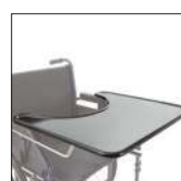
Cod. CPA517 Table for wheelchair large 68x57 cm (only for size 50)