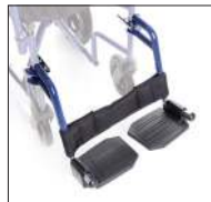
Cod. CPR625 Swing away lateral footrests – PAIR (only for CP620-CP625)