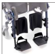
Cod. CAR169 Elevating footrests - PAIR