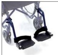
Cod. CPR135 Swing away lateral footrest PAIR (size 38 only)