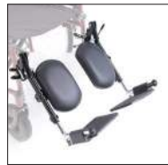
Cod. CPA121 Pedana elevabile verniciata - PAIO DM332/99: 12.24.03.109 DPCM 12.01.2017 12.22.91.718