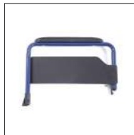
Cod. CPA160 Armrest PAIR (only for CP100, CP102, CP110, CP115, CP500)