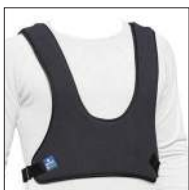
KOALA (MOPEDIA) Restraining system line