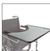
Cod. CPA517 Table for wheelchair large 68x57 cm