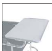
Cod. CPA501 Linear table 55x32 cm