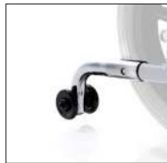
Cod. CAR173 Anti-tipper wheel Ø 5 cm - PAIR (for CP800-CP805 only)