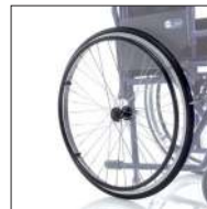
Cod. CPA242 PU rear wheel Ø 60 cm - PAIR (sizes CP115, CP205 only)