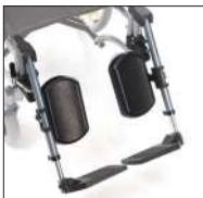
Cod. CAR168 Elevating footrest - PAIR