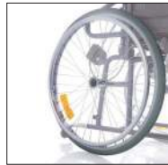
Cod. CAR174 PU rear wheel Ø 60 cm - PAIR (only for CP800)