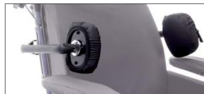
Cod. CAR720 Chest support - PAIR