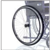
Cod. CPR120 PU rear wheel Ø 60 cm – PAIR (only for CP100)