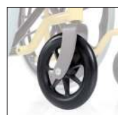
Cod. CPR820 PVC front wheel Ø 15 cm - SINGLE