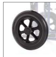
Cod. CPR622 PU solid rear wheel Ø 30cm – PAIR (only for CP625)