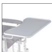
Cod. CPA506 Table for wheelchair 58x38 cm