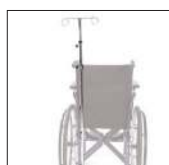
Cod. CPA600 Adjustable IV Pole