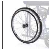
Cod. CPR621 PU rear wheels Ø 50cm – PAIR (only for CP620)