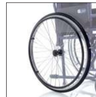
Cod. CPA244 Quick release rear wheel, PNEUMATIC Ø 60 cm - PAIR (only for CP102, CP110, CP200)