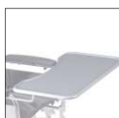
Cod. CPA507 Table for wheelchair 58x38 cm