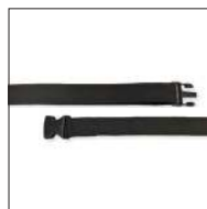
Cod. RP247 Safety belt with spring buckle