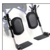
Cod. CPA120V Painted elevating footrests - PAIR