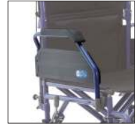
Cod. CPR102 Complete armrest PAIR (only for CP520)