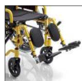
Cod. CPR817 Elevating footrests