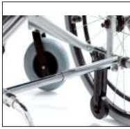
Cod. CAR605 Antitheft bar