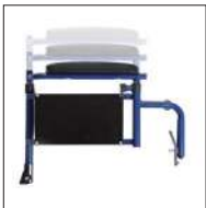
Cod. CPA150 Armrest adjustable height 74÷82 cm from floor - PAIR (only for CP100, CP102, CP110, CP115, CP500)