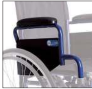
Cod. CPR107 Complete armrest PAIR (only for CP110, CP115)