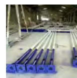
light pole ■