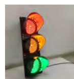
traffic light ■