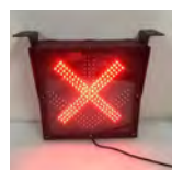
cross arrow light ■