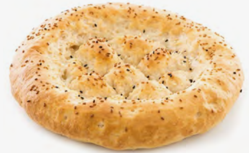
Stock Code: MYHEKDP109