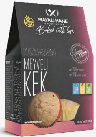
Stock Code: MYH-ATDG132