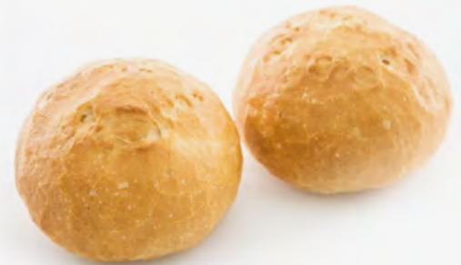
Stock Code: MYHEKDP111