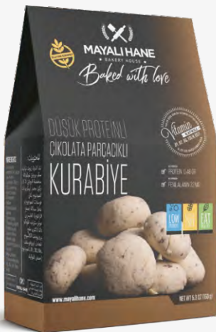
Stock Code: MYH-ATDG128