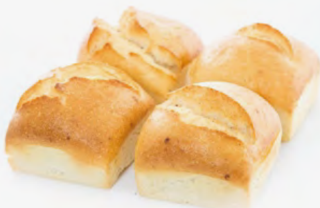
Stock Code: MYHEKDP108