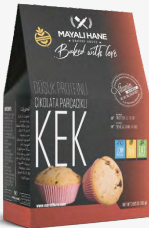
Stock Code: MYH-ATDG126