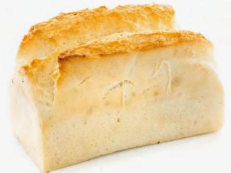
Stock Code: MYHEKDP151