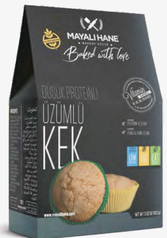
Stock Code: MYH-ATDG138