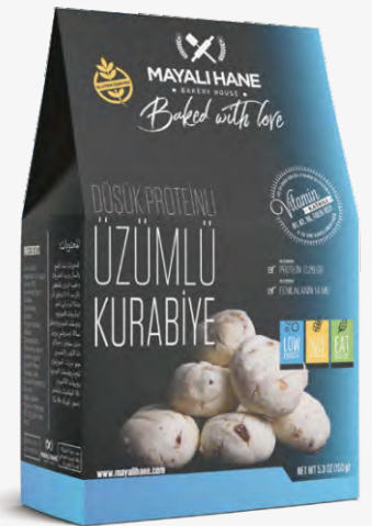
Stock Code: MYH-ATDG139