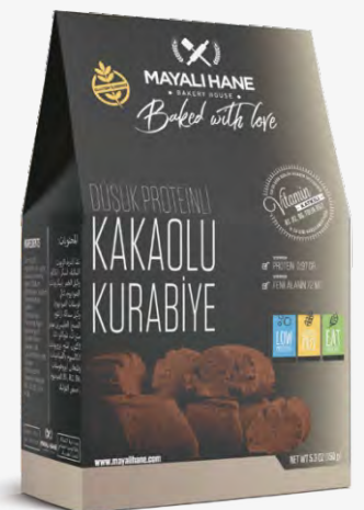
Stock Code: MYH-ATDG130