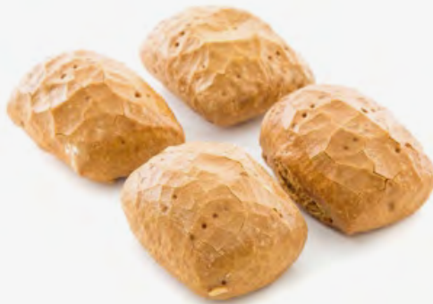
Stock Code: MYHEKDP150