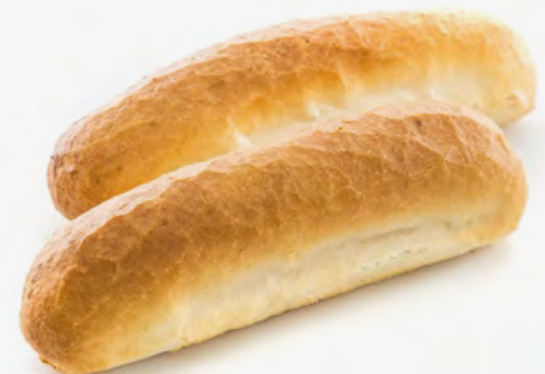
Stock Code: MYHEKDP103