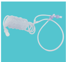
COILED Y-CONNECTING TUBE