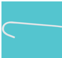
QUICK FILL TUBE