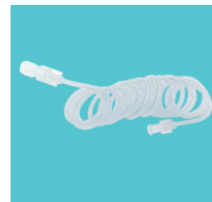
COILED CONNECTING TUBING