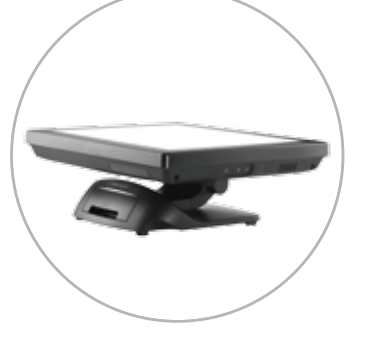
Low Profile Mode Flat Folded Mode