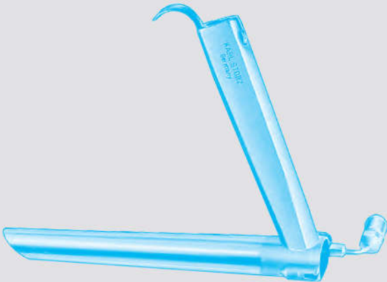
8590 A - L