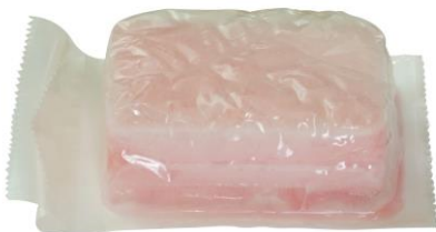
Ref 205-01 % 4 Chlorhexidine