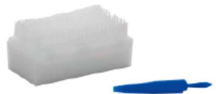
Ref 205-03 Dry Sterile with Nail Pick