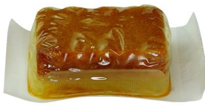
Ref 205-02 %7,5 Povidone Iodine