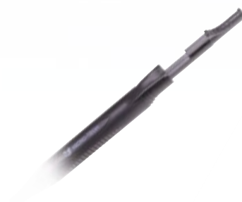
Compact ergonomical design