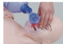
Simple breathing apparatus