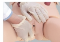
Male urethral catheterization