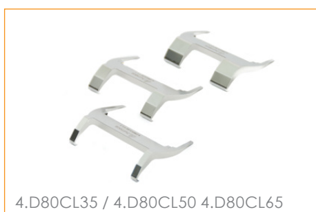
4.D80CL35 / 4.D80CL50 4.D80CL65