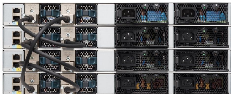
Figure 4. Cisco Catalyst 9200 Series Switch stacked units