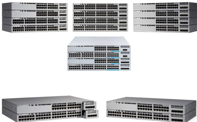
Figure 1. Cisco Catalyst 9200 Series switches

The Cisco Catalyst 9200 Series is made up of modular (C9200), fixed (C9200L) and compact (C9200CX) switch models.