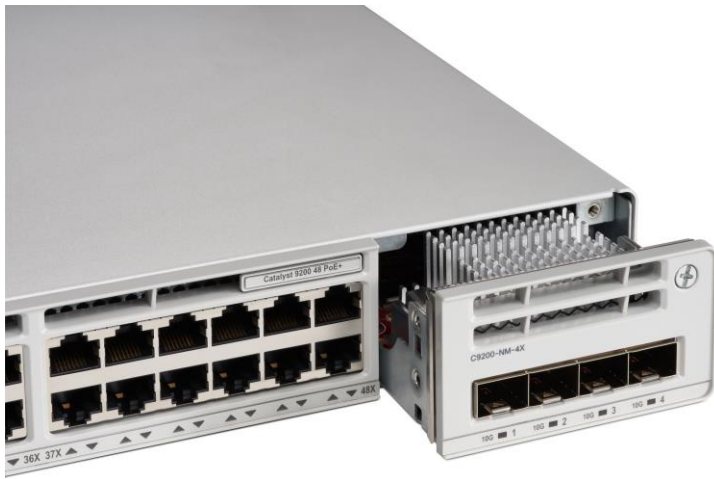
Figure 3. Cisco Catalyst 9200 Series Switch dual redundant power supplies

Table 4 lists the PoE+ power availability for each model.