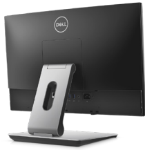
OPTIPLEX 5270 ALL-IN-ONE ARTICULATING STAND

Tilt your display forward, backward, or recline to a 60 degree angle. This stand makes touchscreen interaction comfortable.