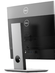
OPTIPLEX 5270 ALL-IN-ONE HEIGHT ADJUSTABLE STAND

Tilt your display forward, backward, or recline to a 60 degree angle. This stand makes touchscreen interaction comfortable.