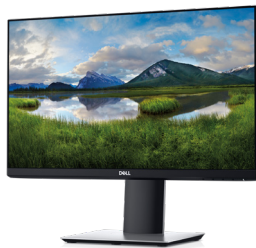
DELL 22 MONITOR - P2219H

The smart choice for dual-display productivity with a 21.5" screen, full range of adjustable features, slim borders, and multiple connectivity points.