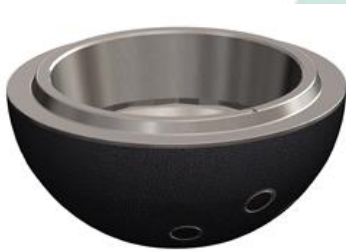
FIG. 3: EcoFit® CUP EPORE®

The EcoFit® Cup EPORE® is a hemi-spherical, 2-piece modular metal shell / polyethylene insert liner acetabular cup. The metal shells are manufactured from wrought TiAl 6 V 4 alloy acc. to ISO 5832-3 in 14 outer diameter sizes from 42 mm – 72 mm through an EBM® Electron Beam Melting process. By using the EBM® process the manufacturing of complex porous structures can be achieved which resembles cancellous bony structures to enhance osseointegration. EPORE® is such a porous structure that is designed to match the natural cancellous bone structure. Specification of this structure is given below.