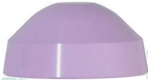
FIG. 6: BIOLOX® DELTA INSERT