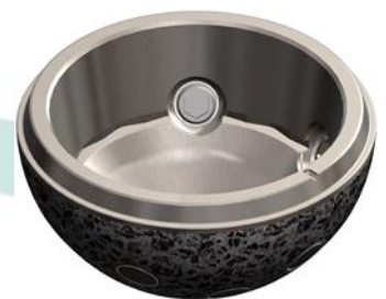
FIG. 1: EcoFit® CUP EPORE® MULTI-HOLE