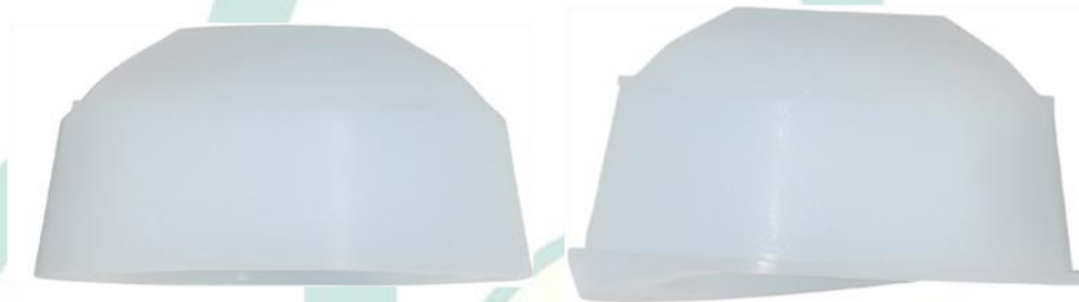
FIG. 5: PE INSERT 0° (LEFT), 10° (RIGHT)

The PE inserts are available in a standard profile configuration (0°, no lateral overhang) and a 10° lateral lip version to provide greater coverage of the femoral head to help prevent dislocation in cases at greater risk of dislocation, such as hip dysplasia.