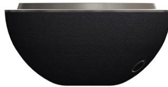
FIG. 2: EcoFit® NH CUP EPORE®