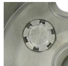
FIG. 4: SCREW HOLE

The metal shell is available in three (3) versions: one with a cluster of three (3) 6.6 mm diameter peripheral holes for placement of 6.5 mm diameter flat head adjunctive bone screws for adjunctive fixation as needed, one with a cluster of seven (7) peripheral holes (designated as Multi-Hole) and one version with no peripheral screw holes (designated as the “NH” version with “NH” representing “No Holes”). All versions feature a 10 mm diameter threaded apex hole for attachment of the cup shell insertion instrument. A threaded 10 mm diameter apex hole plug is provided to eliminate the apex hole after insertion of the shell and 6.5 mm diameter bone screw hole plugs are available to fill any screw holes that are not used for bone screws in the shell that has peripheral screw holes). The optional 6.5 mm diameter bone screws for adjunctive fixation are provided in lengths from 15 mm to 55 mm in 5 mm increments. The metal shells, apex hole plug, bone screw hole plugs, and bone screws hole plugs are manufactured from TiAl 6 V 4 alloy acc. to ISO 5832-3.