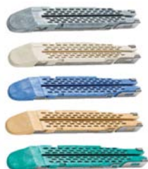
ECHELON 45mm Reloads -For use with all ECHELON 45mm Endoscopic Staplers