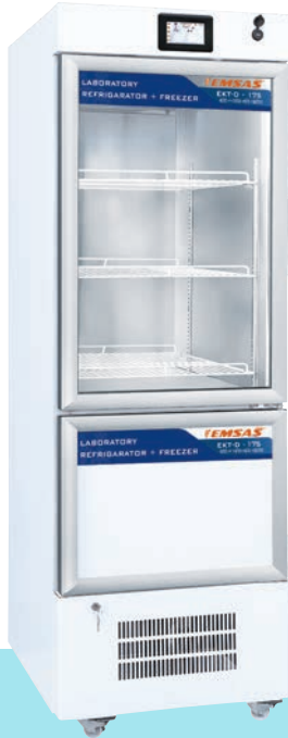
EKT-D 175 (2°C/8°C) (-5°C/-30°C)