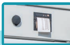
Optional Thermal Printer