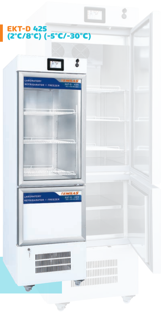
EKT-D 425 (2°C/8°C) (-5°C/-30°C)