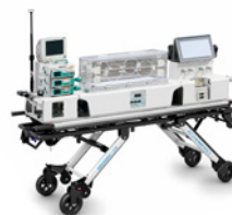
TG-880 C4 IN