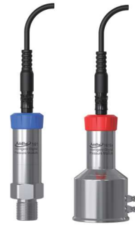
Gauge pressure Differential pressure