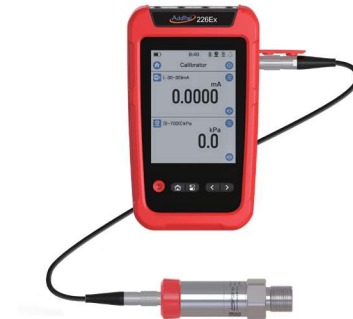
Additel 226Ex with ADT161Ex Pressure Module