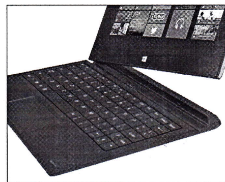
TB-KBD1 - Accessory keyboard for tablet