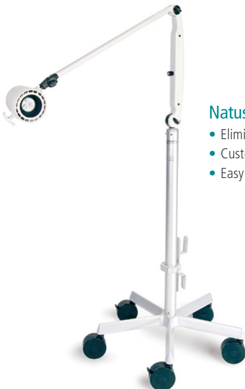
Natus LED Photoc Stimulator