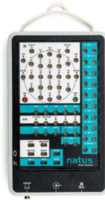
Natus Brain Monitor*

Versatile amplifier expandable for different testing options