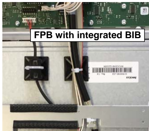
Fig. 1: FPB with integrated BIB

The front panel boards are not forward and backward compatible and the same type has to be used as spare part. All types of FPBs are still available depending on the BIBs present in the machine (see bottom figures).