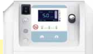
Oxygen concentrator control panel