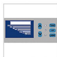
LED Display Microprocessor control system, LED display