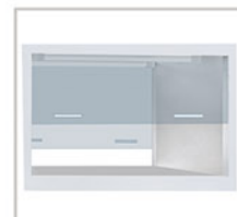
Double Sides Double sides work bench, operators can sit face to face