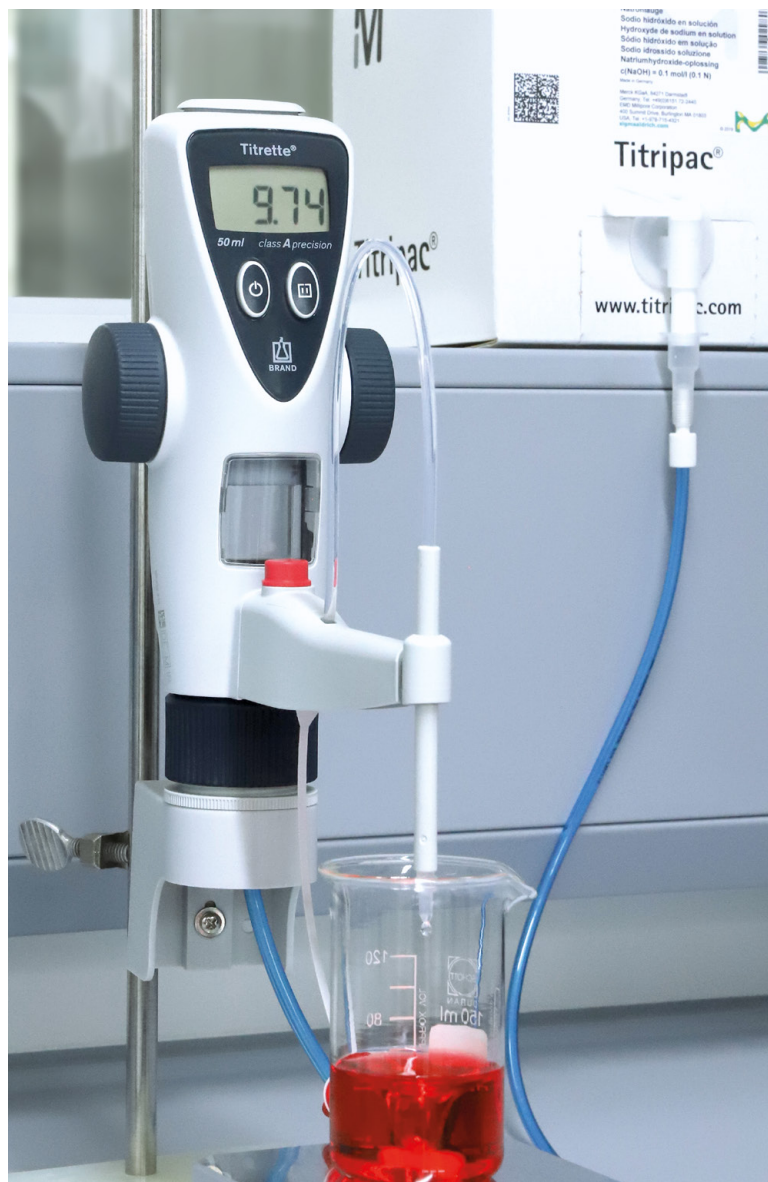
Titrette® extraction system for Bag-in-Box (Titripac® is a registered trademark of Merck KGaA, Darmstadt, Germany)