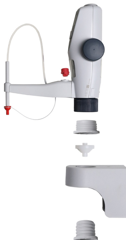
Extraction system for Titrette® extraction system for Bag-in-Box for ready-to-use volumetric solutions