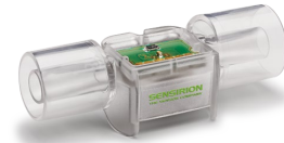
Neonatal Flow Sensor