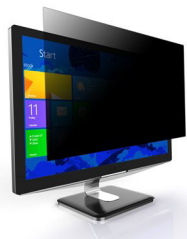
TARGUS 24" 4VU PRIVACY SCREEN

Boost This 23.8" FHD screen with 3-sided ultrathin bezels is designed for seamless multi-display productivity with your 24" All-in-One. Its small base frees valuable workspace.