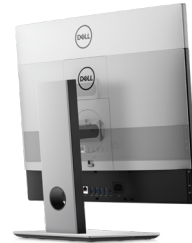
OPTIPLEX 7470 ALL-IN-ONE HEIGHT ADJUSTABLE STAND

Tilt your display forward, backward, or recline to a 60 degree angle. This stand makes touchscreen interaction comfortable.