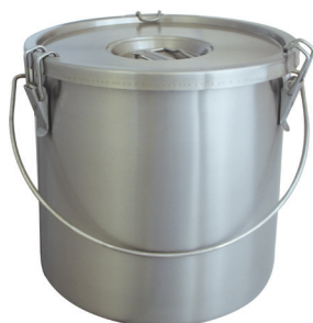
Food Carrying Container Double Skin, S/S Conteneur Isotherme Cylindrique Inox Double Paroi

with sandwich bottom induction ready avec fond "sandwich" compatible avec l'induction