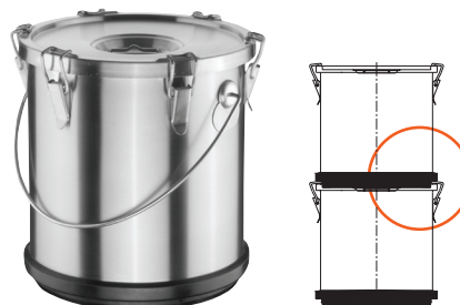
Food Carrying Container Double Skin with Rubber Protection, S/S Conteneur Isotherme Cylindrique Inox Double Paroi avec Protection En Caoutchouc