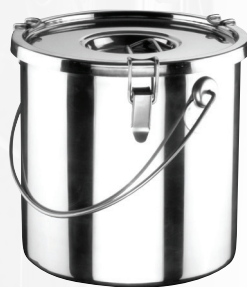
Food Carrying Container, S/S / Conteneur Isotherme Cylindrique Inox