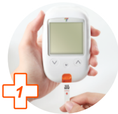
1 Insert a test strip to activate meter automatically