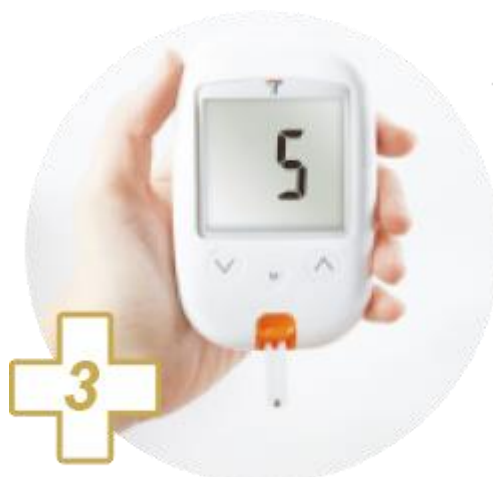
Results in 5 seconds