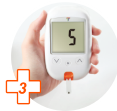
3 Result in 5 seconds