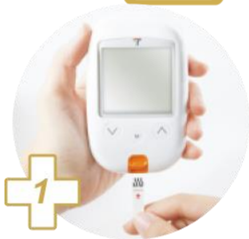
Insert a test strip