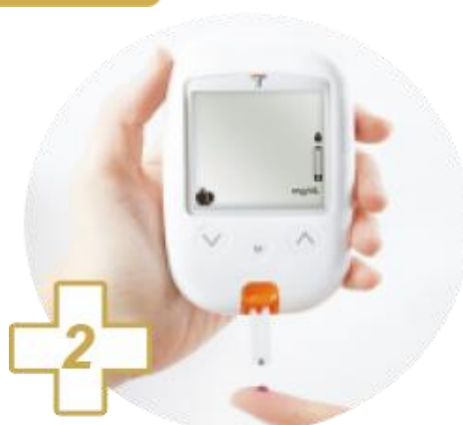
Apply blood sample