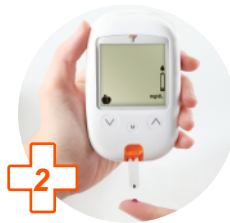
2 Apply blood sample