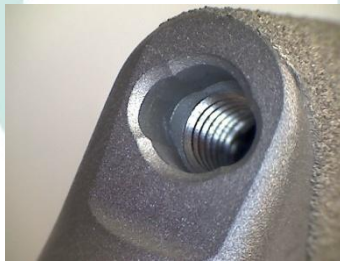
FIG. 8: THREADED HOLE FOR INSERTION INSTRUMENT

The neck has a Morse type 12/14 taper to mate with a modular femoral head. The taper has an angle of 5.7°, a length 13.5 mm, roundness of 0.008 µm, and straightness of 0.003 µm. The taper has a machine turned surface finish producing circular grooves to provide a roughness of Rz of 6 + 14 µm. A threaded hole for the insertion instrument attachment is provided on the superior lateral surface of the proximal stem body.