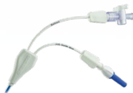
Separate openings for stiffed wire and insufflation