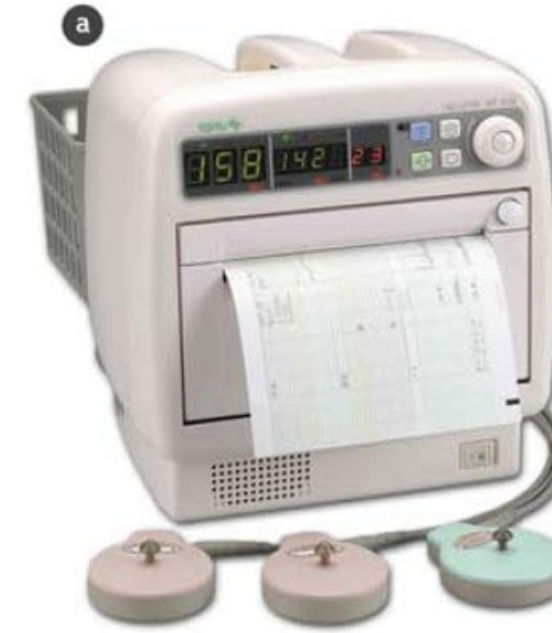
Dimensions: 9.5"W x 10"H x 8"D Weight: 9.9 lbs.